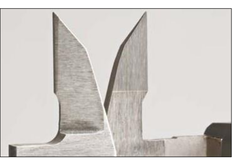
Carbide-tipped jaws for outside measurement.