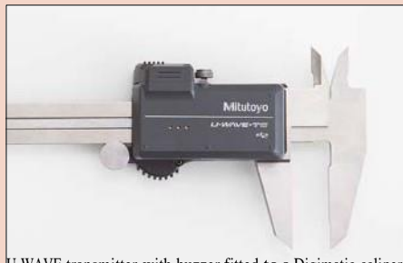
U-WAVE transmitter with buzzer fitted to a Digimatic caliper.