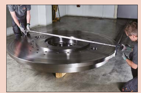
Light weight is an advantage when measuring large

In the unlikely event of a display overflow or calculation error, an error message is displayed and measurement stops. Measurement cannot continue until the error is corrected. If the battery voltage drops below a certain point, the battery indicator will turn on before measurement becomes impossible, warning the user that the battery needs to be replaced. If contamination on the surface of the scale causes a calculation error, an error message is displayed and measurement stops.