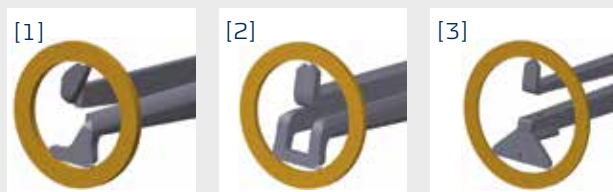
Ball Ø 0.6 mm