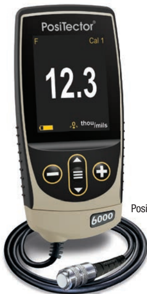
PosiTector 6000 FXS1